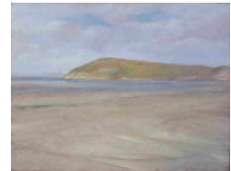
Brean Down, site of the Barrage